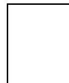
Passport Size Photograph (Guarantor 2)